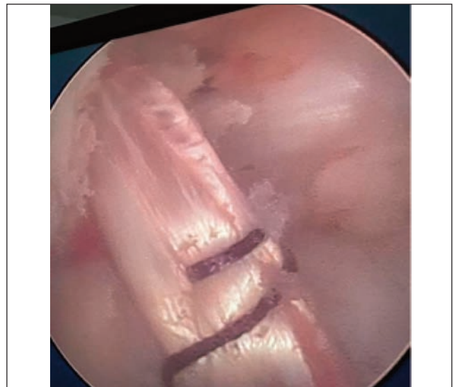
Figure-4: Arthroscopic ACL Reconstruction.

It has been estimated that 61 per 100,000 people experience an acute meniscal injury each year. 8 The similar authors calculate that 850,000 meniscal surgeries are carried out every twelve months in the US. BHMT injuries make up less than 10% of these injuries. 9