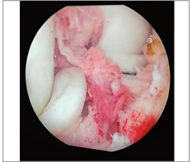
Figure-2: Both medial and lateral meniscus bucket handle tear and complete ACL tear.