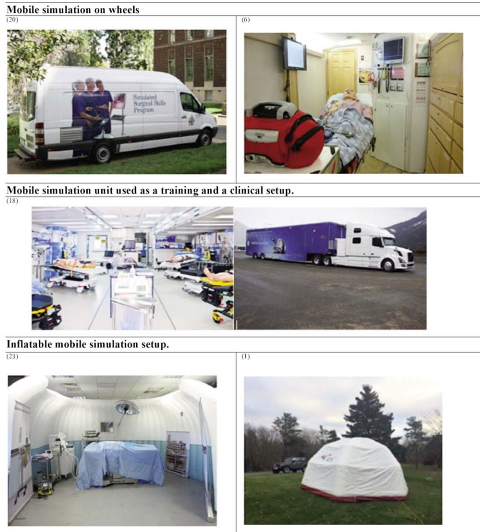
Figure-2: Different approaches to mobile healthcare simulation unit (MHSU).

Many described processes of refurbishing a van or truck; processes of equipping with simulators and task trainers; and development of a team of trainers. There were differences in approach, as some used inflatable structures to recreate a simulation environment, while others became hybrids, being used for both training and provision of care (Figure 2).