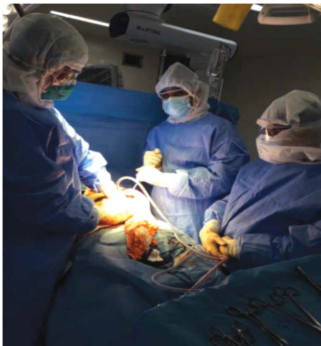
Figure-3: The use of level III personal protective equipment (PPE) during emergency trauma surgery. A limited surgical team comprising a consultant surgeon, trauma fellow, and a technician.

Healthcare workers (HCWs) are at significant risk of COVID-19 infection, 20 but the correct use of PPE mitigates this risk. Direct exposure to bio-hazardous waste put surgical staff, particularly trainee residents, at a significant risk of contracting infection during surgery. A study of 205 COVID-19 patients by Wang et al. 21 investigated the bio-distribution of severe acute respiratory syndrome coronavirus 2 (SARS-CoV-2) ribonucleic acid (RNA) using real-time reverse transcription-polymerase chain reaction (RT-PCR). Results showed the highest rate in bronchoalveolar fluid, followed by sputum and nasal swabs. Few other studies demonstrated high viral load in stool, urine and blood. Evidence-based teaching was done along with