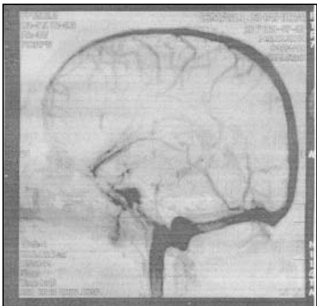
Figure 2. MRV of the intracranial venous structures shows very faint visualization of the internal cerebral veins, the vein of Gallen, the straight sinus and the right transverse sinus.

Pressure of 200/110 and placed her on antihypertensive medications. She rapidly deteriorated on the third day and was brought to the Emergency Room. On examination, she was found to be mute with gradual onset of stupor, bilateral papilloedema, poorly reactive pupils, upgoing plantars. Cerebral Non Contrast CT revealed cerebral oedema with bilateral thalamic edema. EEG showed diffuse theta and delta slowing suggesting generalized neuronal dysfunction. She was intubated because of inability to control airway and progressively depressed mental status. A provisional diagnosis of deep venous thrombosis was made and IV heparin was started on the 4th hospital day. The patient slowly began to regain consciousness after initiation of heparin. She was following commands on the 5th hospital day and was extubated on the 6th. She was placed on warfarin and this was discontinued after a year. She is neurologically intact, except for mild upgaze restriction at 6 years without recurrences.