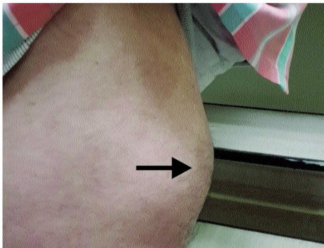
Figure-2: LH Front of thigh.