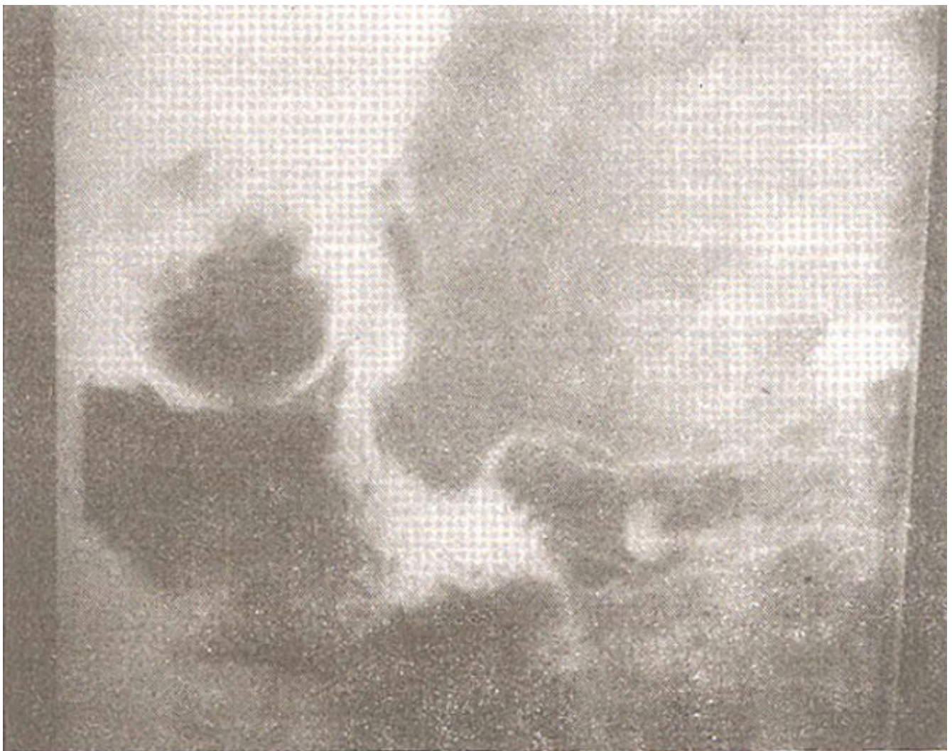
Figure 1 Barium Meal film of case 2 showing a roundish filling defect in the mid-lesser curve of the stomach which at laparotomy was a leiomyoma.