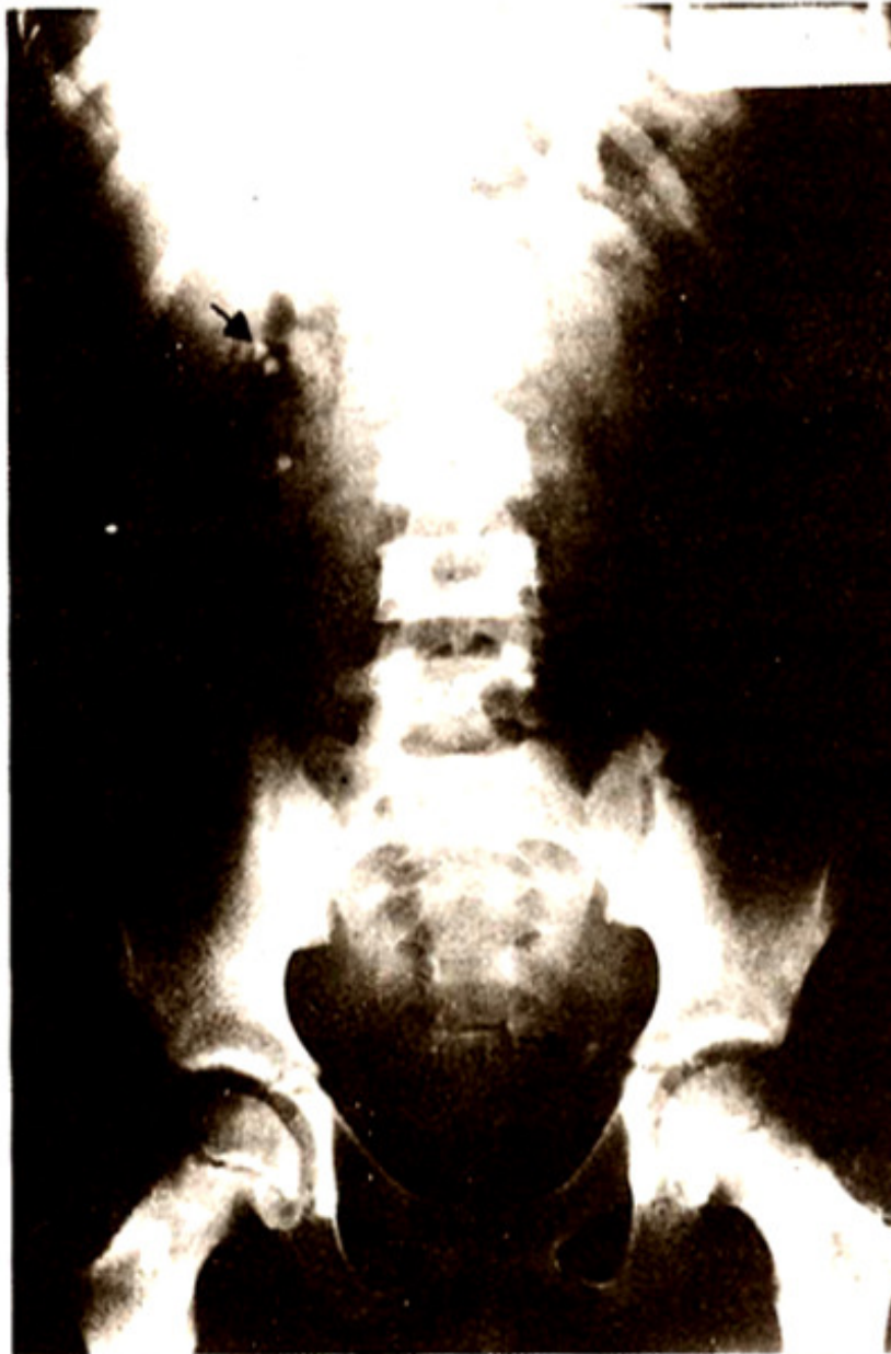
Figure 1. Pre-operative, plain X-ray of abdomen showing left ureteric and multiple right renal calculi.

revealed a 1.5 cm/0.5 cm left lower ureteric stone with three small 0.5 x 0.5 cm stones seen in the right renal pelvis. Intravenous program (IVU) showed moderate hydronephrosis. Metabolic work up carried out on serum and urine did not reveal any cause for stone formation. Under general anaesthesia cystoscopy was performed and a Double J Stent (DJS) was placed in the left ureter (Figure 2).