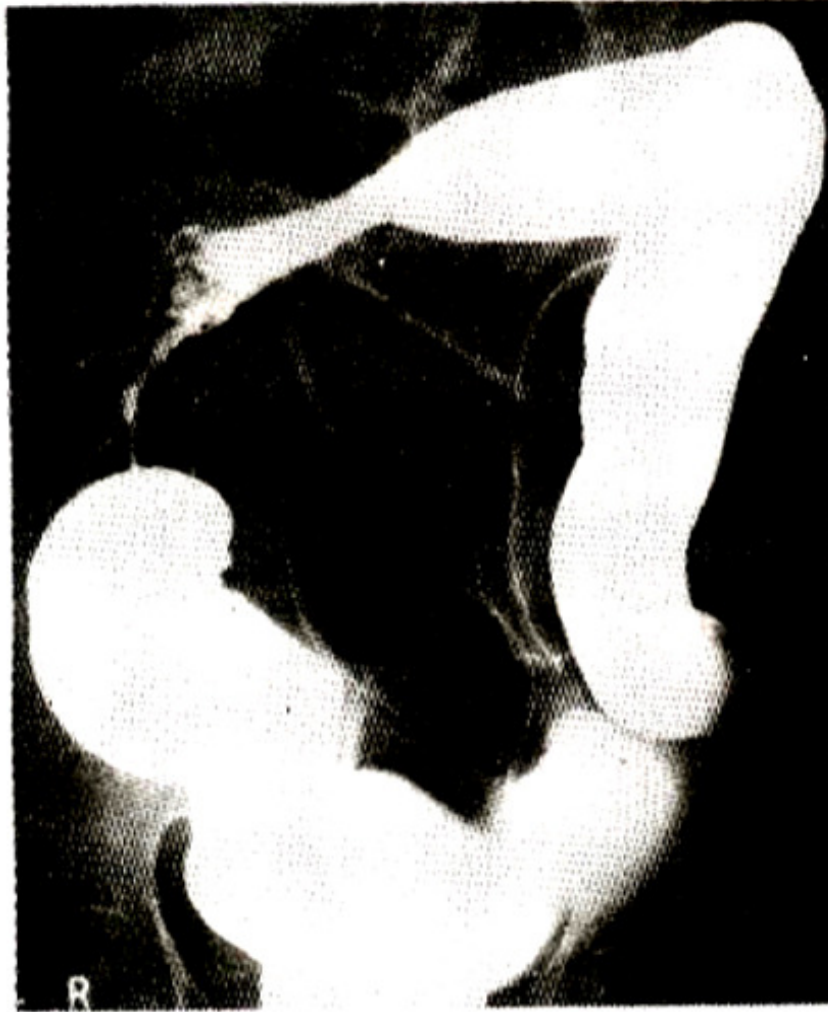
Figure 1. Pre-operative single contrast barium enema showing a long stenotic segment involving the ascending and adjacent transverse colon with ulcerations.

Colonoscopy and subsequent surgery showed a 15cm long stenosed segment engrossing the ascending and proximal transverse colon and containing a large polypoid growth arising from caecum and ascending colon with multiple satellite polyps. Histopathologically, there was a well differentiated mucin secreting adenocarcinoma. Present within the tumour producing colonic tissue were granulomas showing central necrosis and giant cells suggestive of tuberculosis. Regional mesenteric lymph nodes also contained similar granulomas. A diagnosis of adenocarcinoma (Duke's stage B2) with coexistent tuberculous colitis was made. Three years after right hemicolectomy and chemotherapy, the patient was alive with metastases, secondaries in peritoneum, sigmoid and recurrence at anastomotic site (Figure 2 and 3).