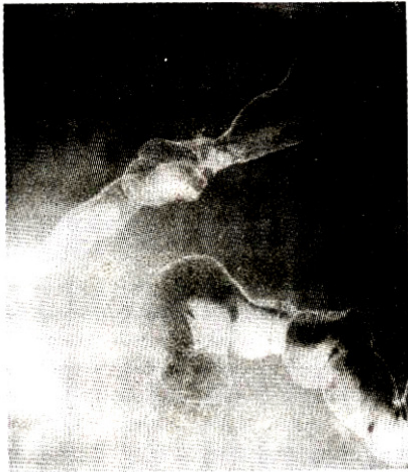
Figure 2. Post-operative double contrast barium enema. Tumour spread to superior part of sigmoid with mucosal lethering. Irregularity at anastomotic site is also seen.