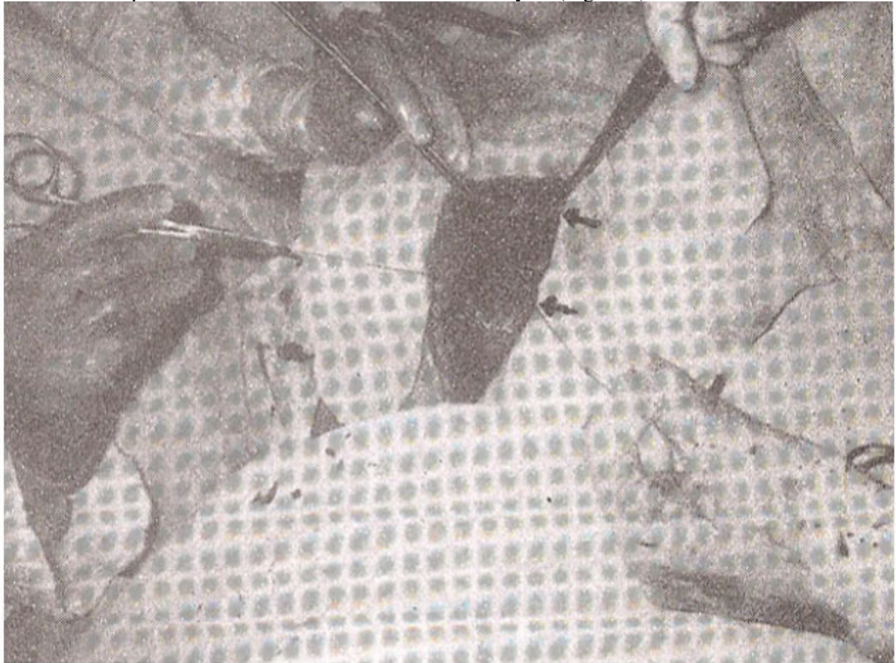
Figure 4. Transabdominal transperitoneal repair of the fistula done after mobilising the bladder off the uterus, cervix and upper vagina. the arrows indicate suture lines in the bladder and uterus after repair.

examination and IVP were uninformative. Ultrasound cystoscopy and hystero-graphy confirmed the fistula between the bladder base and uterus above the cervix. Examination under anaesthesia after instilling 150 ml of dye showed no abnormality, but on putting another 300 ml of dye into the bladder, the same was seen escaping through the cervix 7 . A transperitoneal abdominal repair of the bladder and uterus after adequate mobilisation was carried out in two layers (Figure 4).