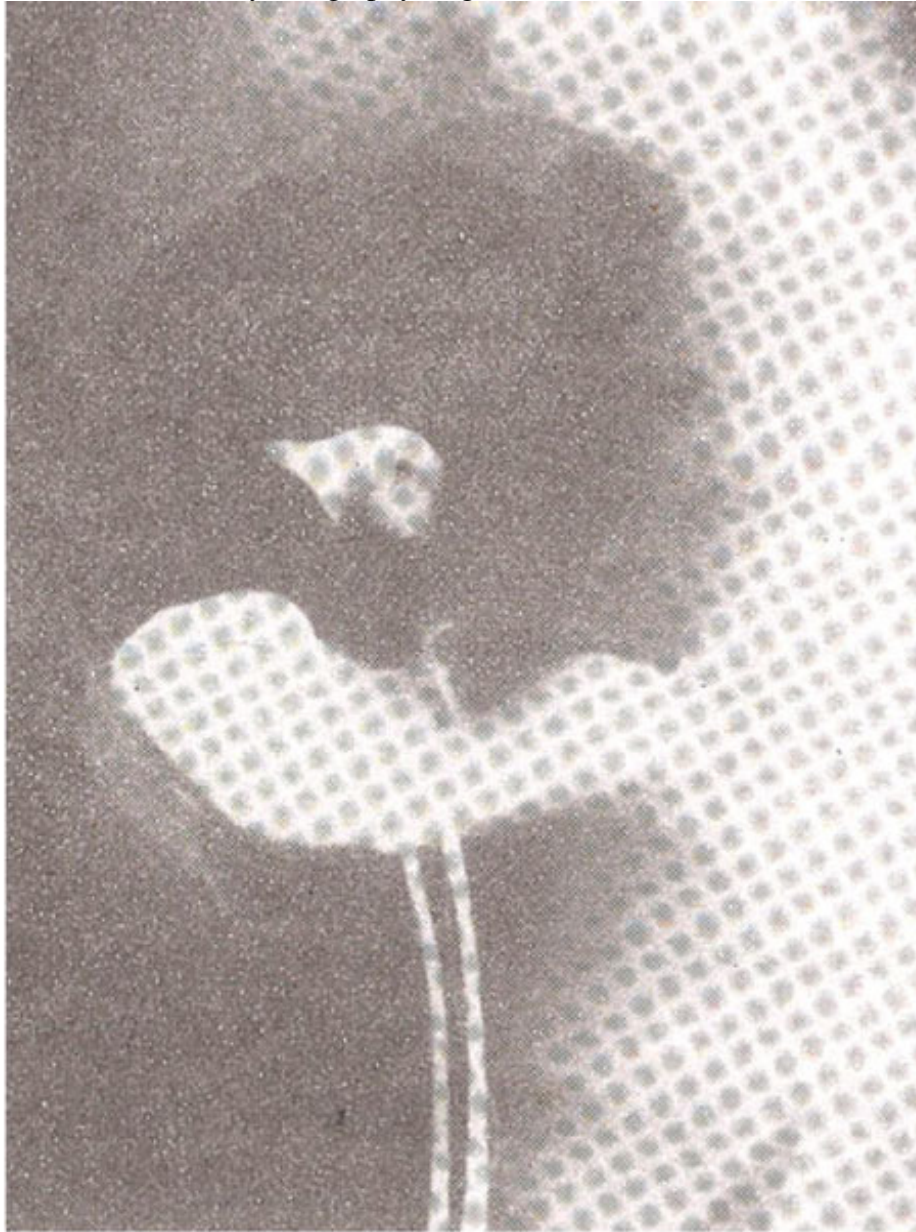
Figure 3. The presence of contrast medium in the bladder on hystero-graphy confirms the presence of vesicouterine fistula despite urinary continence.

A 26 year old para 1+0 had an elective caesarean section for breech presentation 10 months earlier. She presented with painless gross haematuria lasting 6 days on two occasions a month apart and was amenorrhoeic since Caesarean section. No abnormality was detectable on examination, laboratory investigations and IVP. Cystoscopy showed a 0.5 cm vesicouterine fistula 2 cm above the trigone, which was also demonstrable on hystero-graphy (Figure 3).