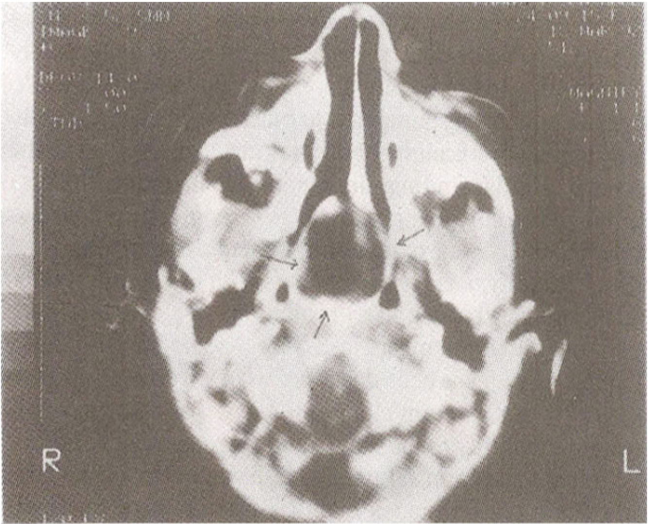
Figure 2. CT-Scan of the oropharynx. Arrows mark the tumour occupying the posterior nasal choanae. There is no intracranial communication.

confirmed a 2 cmx2.5 cm cystic mass with smooth margins. arising from the posterior nasal septum and attached to the base of the skull. There was no obvious intracranial communication.