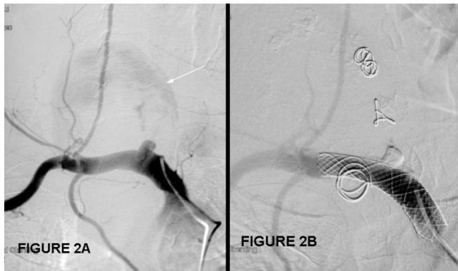
Figure-2: A) Right brachiocephalic artery digital subtraction angiogram showing common carotid stump filling large pseudo aneurysm. (Arrow) and non-filling of the distal common carotid artery and its branches. This is an iatrogenic injury following central line placement. B) Successful embolization with self expanding metallic stent, coils and histoacryl glue resulting in complete exclusion of the pseudo aneurysm.

haematuria following transplantation of kidneys. Pseudo-aneurysm and arteriovenous fistula was detected in one patient, which was taken care of with balloon and coil embolisation. The other had extravasation which was treated with coil embolisation. Another coronary artery bypass graft (CABG) patient developed pseudoaneurysm of ascending aorta during surgery and was immediately shifted to the angiography suite where pseudo-aneurysm was excluded with detachable coil embolisation. Active extravasation was noted in a patient following renal biopsy. He was embolised successfully with coils, but could not recover from the shock and died during the same hospital stay.