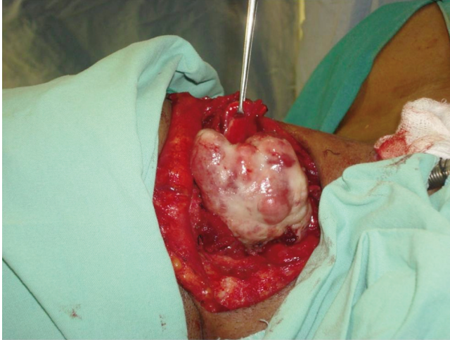
Figure-2: Intraoperative view showing the mass still attached to the larynx.

findings favoured a vascular lesion most likely haemangioma. Two weeks later, the patient was scheduled for excision of the supraglottic neoplasm.