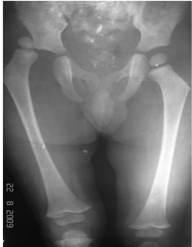
Figure-1: Traumatic dislocation Right Hip in 2 years and 4 months old boy.

Associated injuries were present in two cases etiology was motor vehicle accidents in both cases (Case 1 and Case 8 in Table-1). Case 1 was the youngest case in our series. He had head injury and reported to hospital within two hours of the accident. He was admitted and kept under observation by neurosurgery department. Diagnosis of associated Posterior hip dislocation was made after 24 hours (Figure-1) and hip