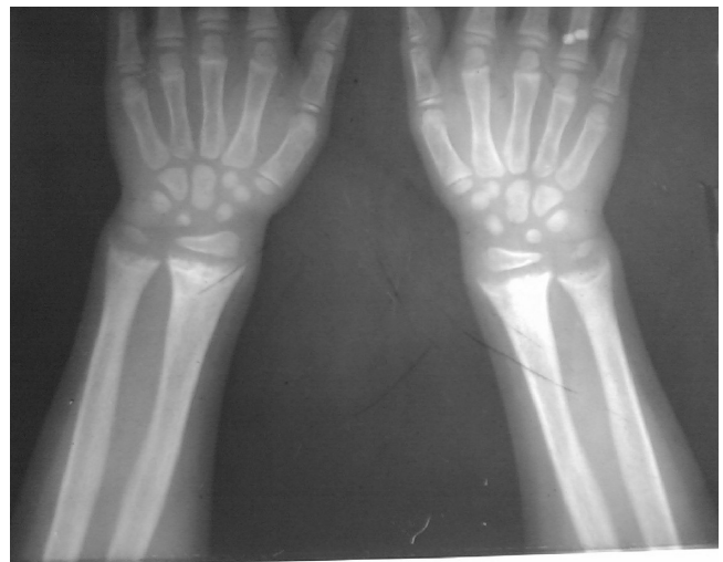
Figure-1: X -Ray both wrists showing changes of rickets in distal ends of Radius and Ulna.